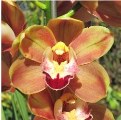
Cym (Edith Piaf 'Bananarama x Khairpour 'Perfection')